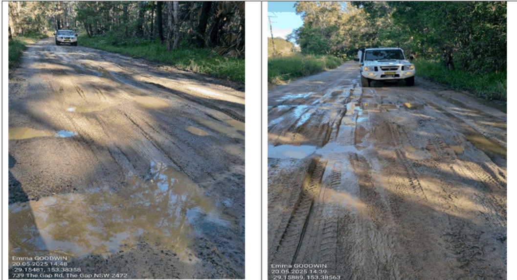
Gap Road Crown and Richmond Valley Council Sections 20/5/25

to Cat 1 standard. NPWS can project manage Crown and Richmond Valley sections if they contribute financially. Crown Lands will provide 5K which is enough to grade the road but gravel is urgently required. RVC at this stage have not advised they will contribute to any road work.