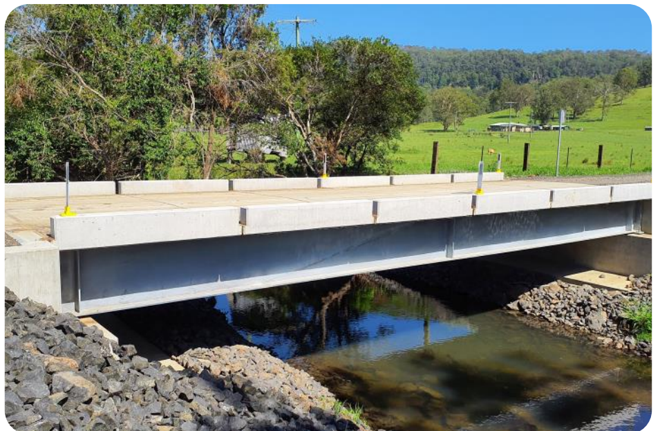
The recently completed Armstrongs Bridge on Tunglebung Creek Road.

"At times, Council has had up to six bridge construction crews working at the same time, on separate sites, to meet the delivery timeframes set out in the funding agreements.