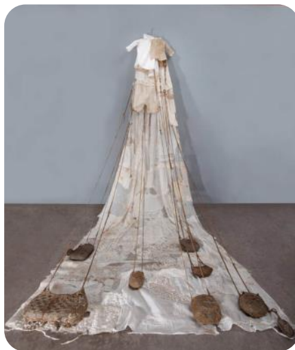
Two of the textile creations which will be on show at Council's Roxy Gallery as part of the Fibre Arts Australia's International Art Textile Biennale 2023.