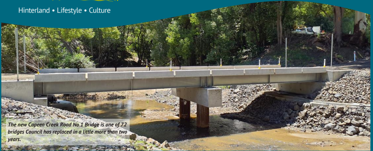
The new Capeen Creek Road No 1 Bridge is one of 72 bridges Council has replaced in a little more than two years.