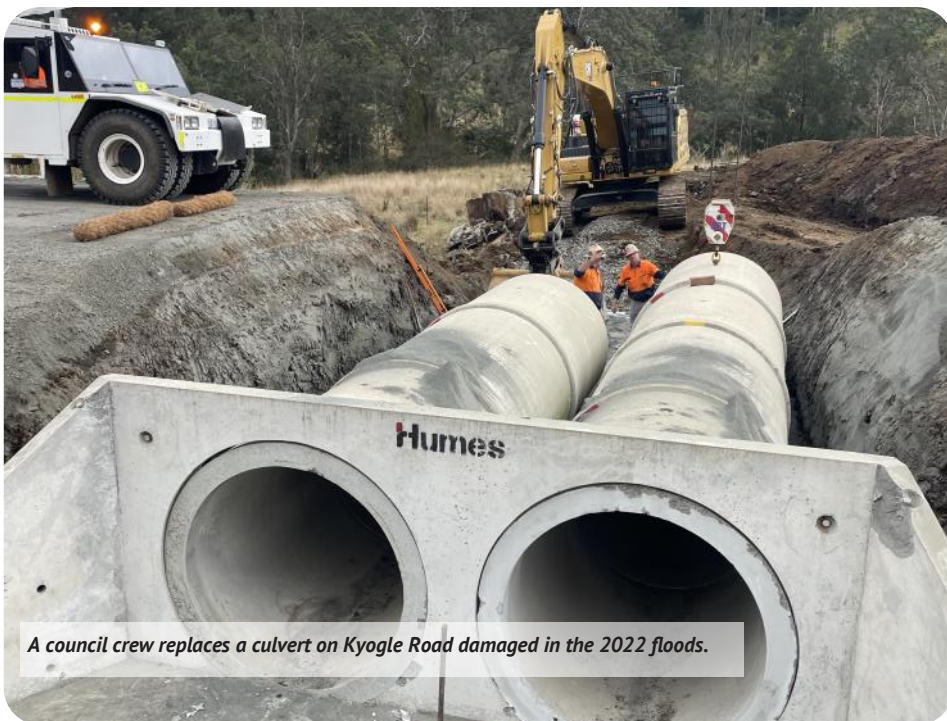
A council crew replaces a culvert on Kyogle Road damaged in the 2022 floods.

Council has recently undertaken works within Kyogle township addressing damage eligible under the disaster recovery funding