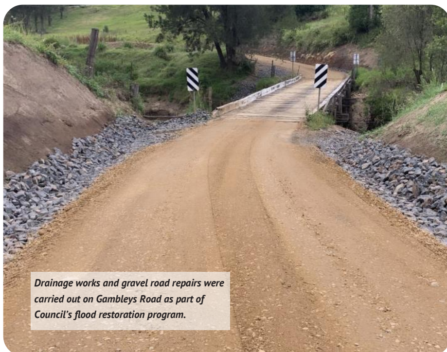
Drainage works and gravel road repairs were carried out on Gambleys Road as part of Council's flood restoration program.

Council has committed its resources to returning life back to normal as quickly as possible post floods.