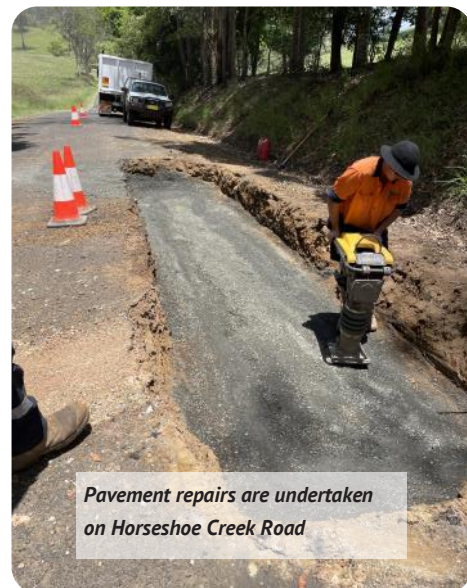
Pavement repairs are undertaken on Horseshoe Creek Road

Council also has external funding to deliver a series signature projects, the Mallanganee observatory lookout ($1.9 million) the Kyogle health and wellbeing hub and aquatic centre ($6 million), the Kyogle Civic Precinct activation ($2.3 million) and the Kyogle Main Street revitalization ($3.3 million). Due to the unprecedented scale of the works program ahead for Council, and the need to prioritise