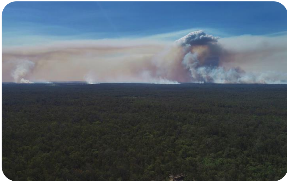
Jimmy Malecki's photo of the Bungawalbins showing the 2019 Myall Creek Road and Bora Ridge fires.

The exhibition will feature photographs contributed by community photographers, as well as portraits by Jodie and Ben with link-