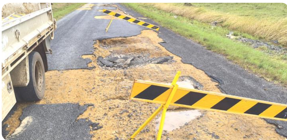
Council's draft budget for the coming four years prioritises the restoration of the flood-damaged transport network and the completion of externally funded projects such as the upgrade of the Clarence Way.

So far Council has completed $33 million of the $254 million of flood reconstruction work, and will continue to focus on that work over the coming two years. The flood restoration is funded by the