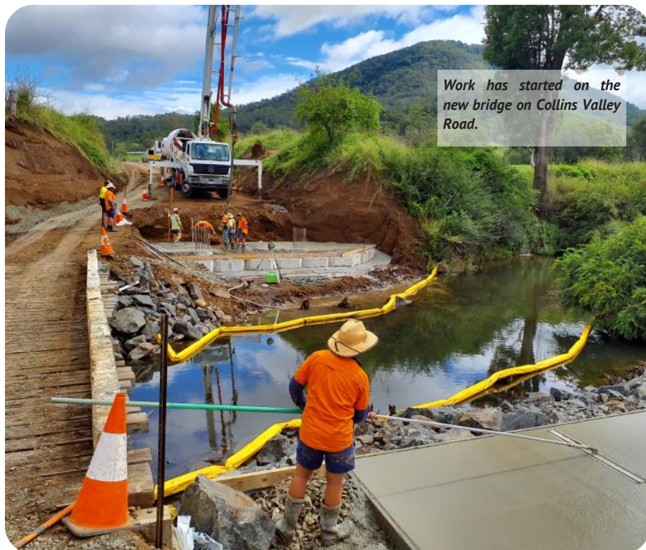
Work has started on the new bridge on Collins Valley Road.

Crews have been working to improve drainage of unsealed roads across the