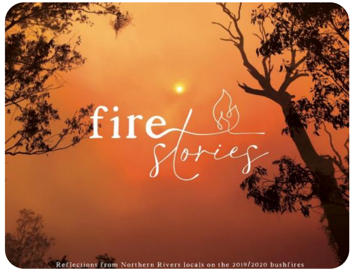
The Fire Stories book, pictured, will be launched at the official opening of the Fire Stories exhibition at Council's Roxy Gallery.