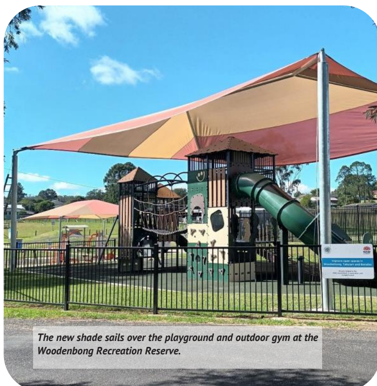
The new shade sails over the playground and outdoor gym at the Woodenbong Recreation Reserve.

Council has been able to install the shade structure thanks to a NSW Government Grant.