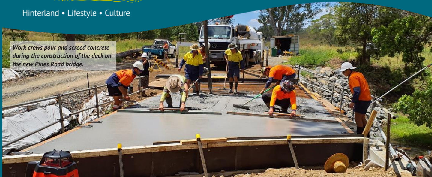
Work crews pour and screed concrete during the construction of the deck on the new Pines Road bridge.