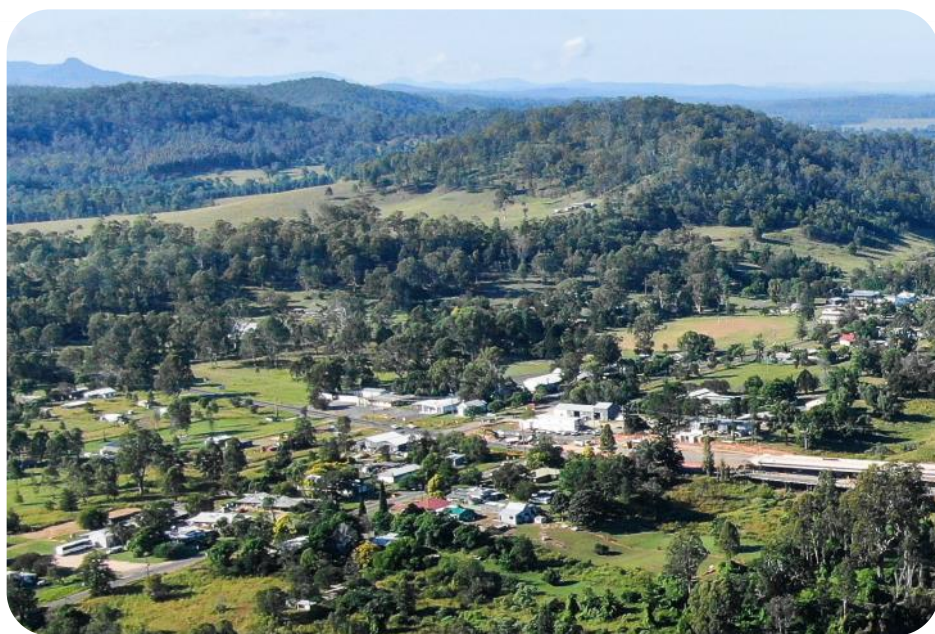
A town water supply for the village of Tabulam is a step closer after Council authorised the General Manager to start the process of finding and buying land for a water treatment plant and reservoir.

water system upgraded further, an additional reservoir and a truck main constructed to supply water to Jubullum in addition to the village of Tabulam (estimated at $5.73 million).