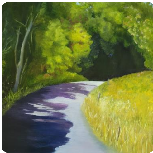
Maryanne Shea's Silent Road .