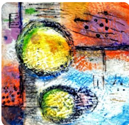
A selection of artworks which will be on show at Council's Roxy Gallery as part of the Generational Genres exhibition.