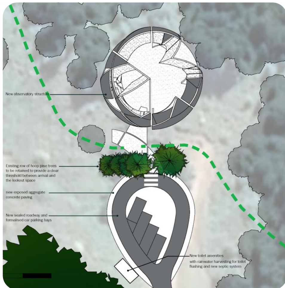
A site plan of the proposed Mallinganee Observatory. The existing telecommunications tower will stay in place, with the tower compound to be screened by plantings and landscaping. The green line is part of the proposed walking track through the Mallinganee National Park.

Further community consultation will be carried out at all key stages of the project.