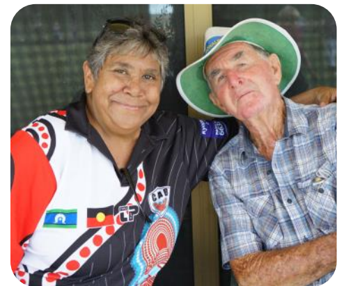
Revelers at the West of the Range Australia Day celebrations watch the barefoot bowls competition.

Business/Service of the Year , Woodenbong Thrifty T