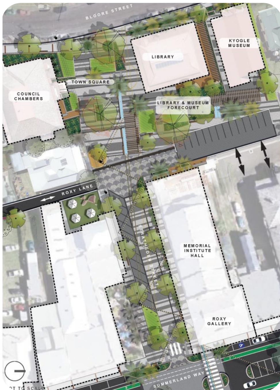
The revised concept plan for Kyogle's Civic Heart Precinct.

"The introduction of shade trees and other landscaped areas is an important component in ensuring that Kyogle remains