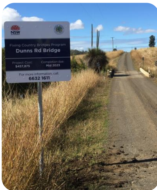
Work on the Dunns Road Bridge replacement at Doubtful Creek is expected to start in December. The new bridge is being built under the State Government's Fixing Country Bridges Program.

In December, work will start on new bridges on