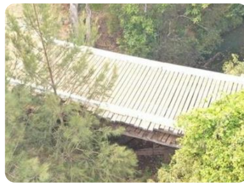
The old bridge on Leesies Road effectively had a bridge built on a bridge as a temporary repair.

cropping and other high intensity agribusinesses.