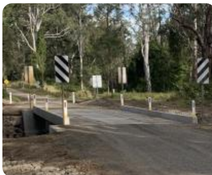
The new concrete bridge on Yabbra Road over Haystack Creek.