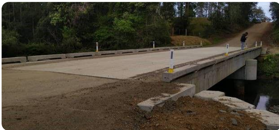
The new Mathews Bridge, above, replaces a load-limited timber bridge which severely impacted the lives of people living in the Green Pigeon Valley and commercial orchard operations.

The old bridge was given a temporary repair previously, effectively a bridge was built on a bridge, to provide access to