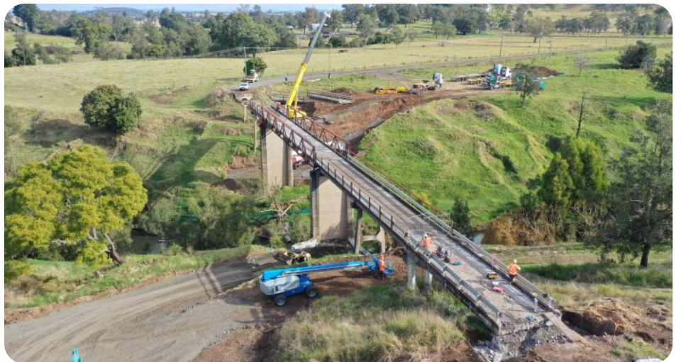
Work has started on a $2.6 million project to build a new bridge across the Richmond River at Cedar Point.

Like the old bridge, the new bridge will be single lane, however it won't have any