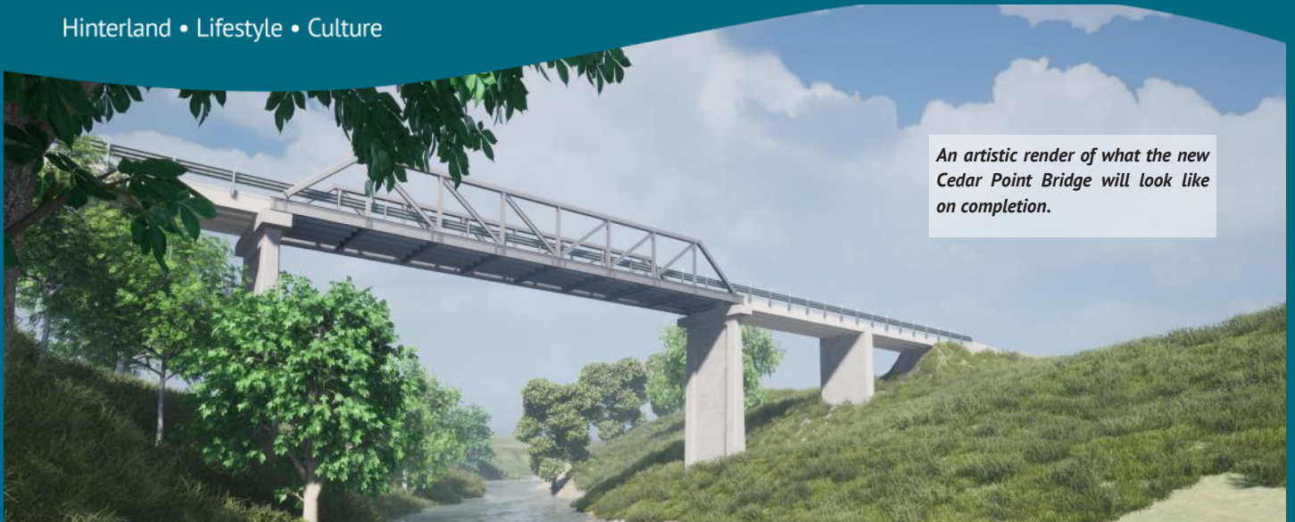
An artistic render of what the new Cedar Point Bridge will look like on completion.