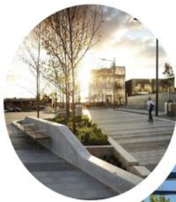
Open civic space suitable for markets and other events