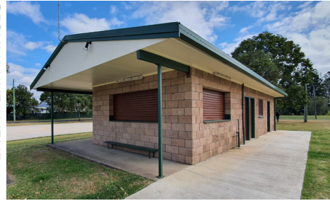
Example canteen and amenities building from Anzac Park, Kyogle