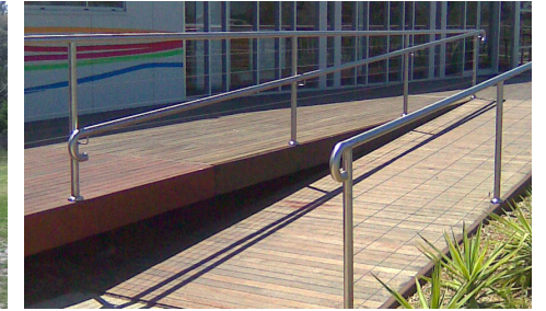
Example of an accessible (Disability Discrimination Act compliant) entry