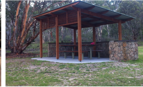
Example of a shaded picnic node