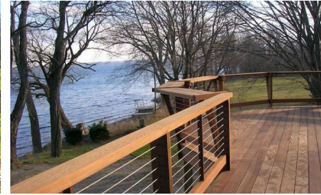
Example deck and railing style viewing platform