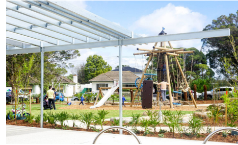
Example picnic and play space from Sunvale Community Park