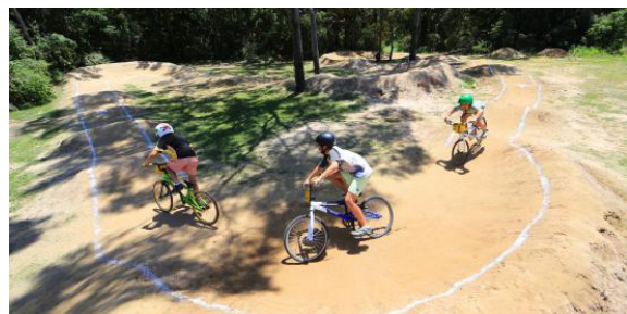
Example of a dirt BMX / pump track