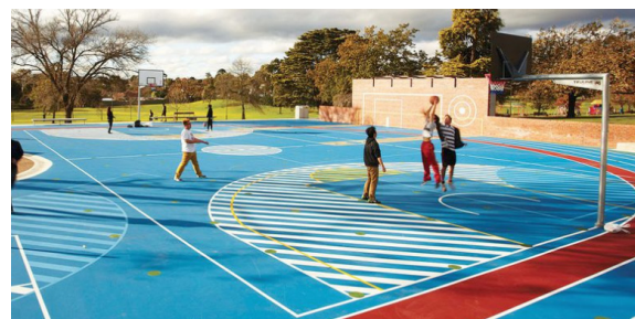
Example of a multi-purpose court in Box Hill Gardens