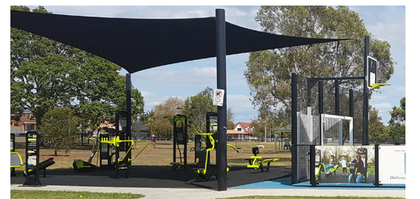
Example of a shaded fitness equipment station

Drawing Details Site name: Tabulam Sports Ground Scale: 1:500 at A3 Date: 22 July 2020 Sheet: 1 of 1