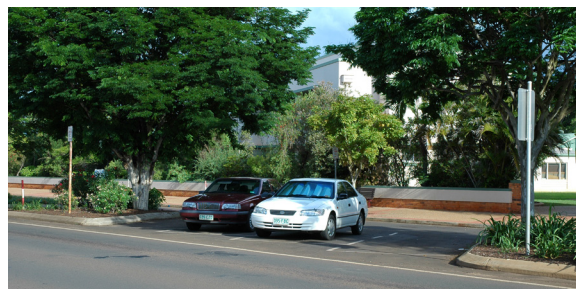
Example of on-street parking with kerb build outs for street trees and landscaping