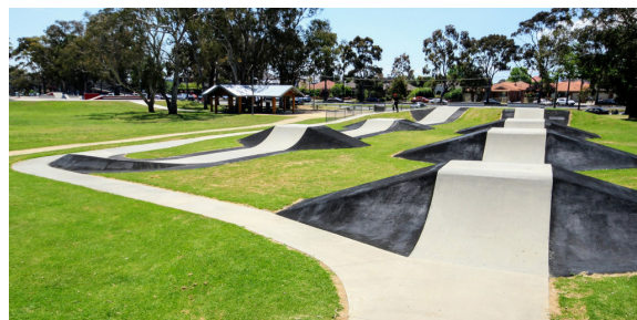
Example of a concrete and bitumen BMX / pump track