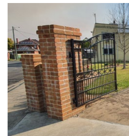
Village entry pillars replicated as entry statements to the Reserve