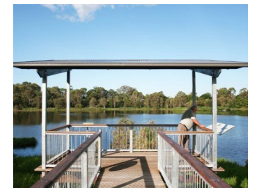
Deck structure with shade provision overlooking water

*Multi-use fields are shown indicatively.