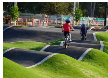
Example of a bitumen BMX / pump track (Bracken Ridge, Brisbane. Photo by BrisbaneKids)