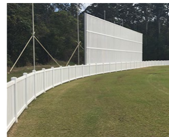
White PVC picket sports field fencing