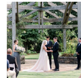
An arbor used as a backdrop for a wedding ceremony