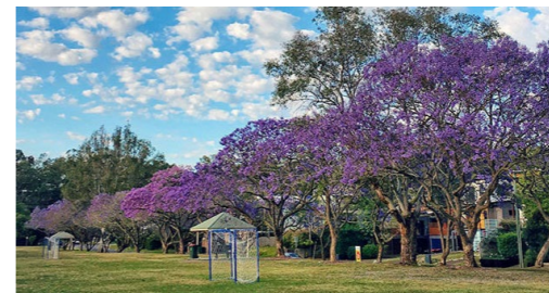
Example of large shade trees lining the edge of an oval