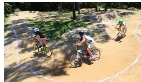
Example of a dirt BMX / pump track