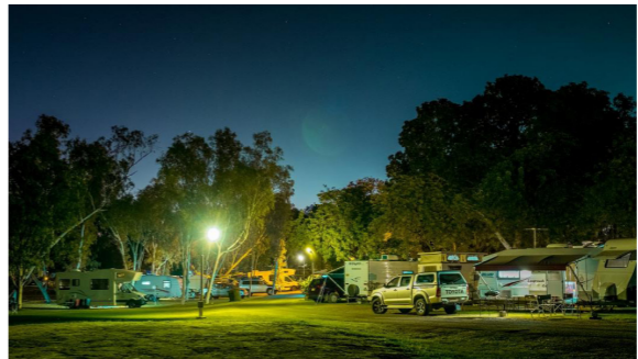
Formalised caravan and camping layout with solar powered lights and power