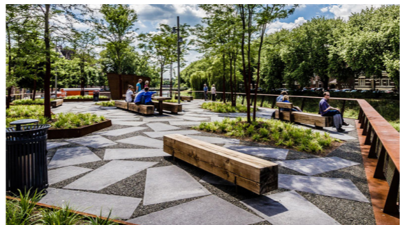
Example of a civic gathering space from Saint John's Bulwark