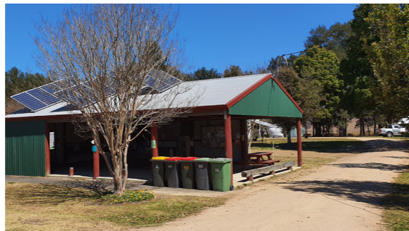
Camp kitchen example from Woodenbong Sports Ground