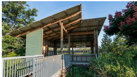
Example of a bird hide from Seaham Swamp Nature Reserve