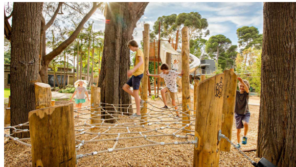
Example of nature play from Adelaide Zoo (designed by WAX Design)