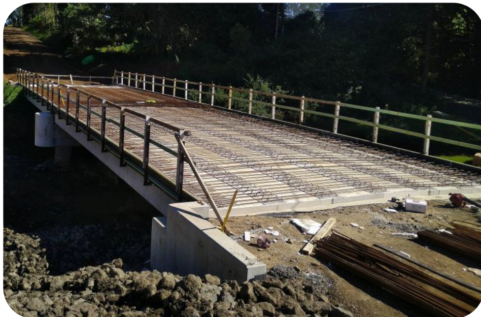
Council's bridge crew prepares to lay the concrete deck on the new Matthews Bridge on Green Pigeon Road.

This proof of concept bridge should cut installation time to less than a third that of a normal bridge, reducing the time motorists are inconvenienced.