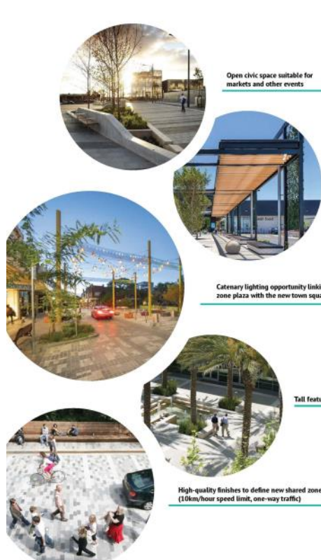
Open civic space suitable for markets and other events

Option 4 – no changes other than 40kph zone – 40kph zone through town centre, retain current parking arrangements, retain town clock in current location, no additional landscaping or seating or gardens, no loss of parking spaces on Summerland Way