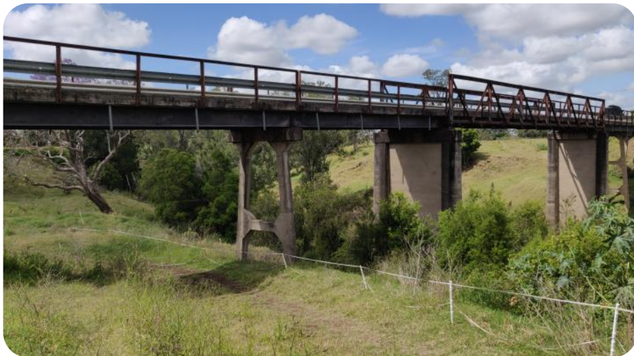
Work on the new Cedar Point Bridge on Edenville Road is expected to start in June.

Work continues on the upgrade of Bruxner Highway near Rodgers Road.