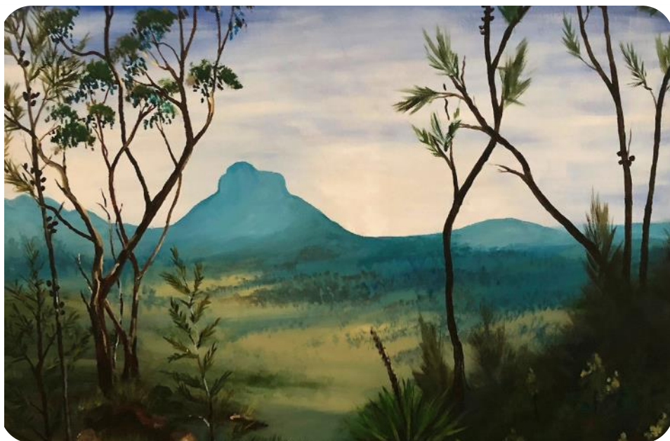
This painting by Christine Reid of Mount Lindsay from the top of Edinburgh Castle will feature in June's Working WAGS exhibition at Council's Roxy Gallery.

Woodenbong is a thriving area full of beauty that inspires the creative mind.