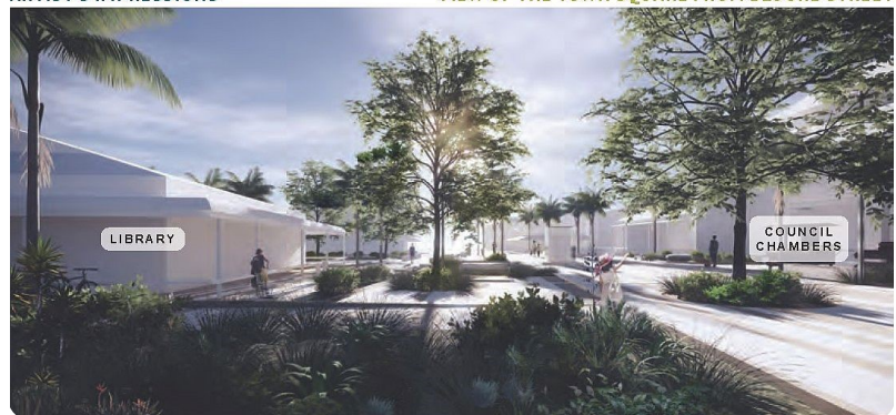
VIEW OF THE TOWN SQUARE FROM BLOORE STREET