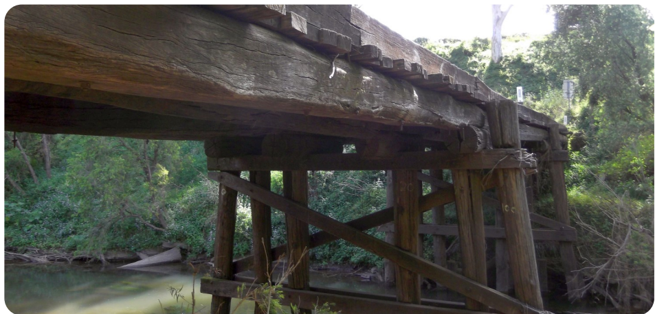
Baileys Bridge on Baileys Bridge Road is one of 95 old timber bridges that will be replaced as part of a major project to be rolled out over the next two years.

Council received a $40.419 million grant through the State Government's