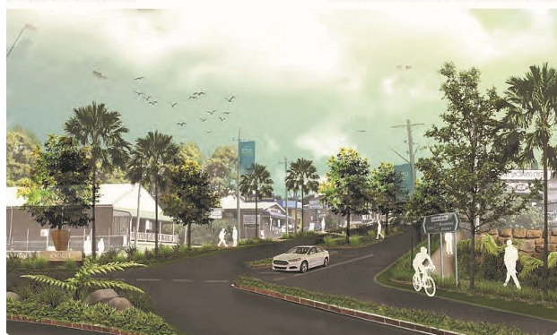
NORTHERN GATEWAY (AT KYOGLE ROAD)