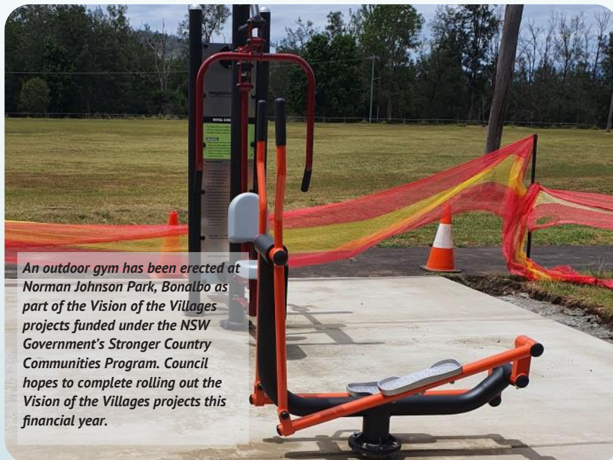
An outdoor gym has been erected at Norman Johnson Park, Bonalbo as part of the Vision of the Villages projects funded under the NSW Government's Stronger Country Communities Program. Council hopes to complete rolling out the Vision of the Villages projects this financial year.

At the time of writing this, all our planned celebrations will continue but remain subject to any directions from the