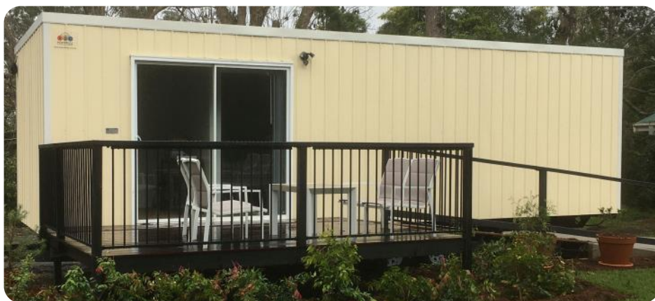
Council installed two accessible cabins at the Kyogle Gardens Caravan Park to provide new visitor accommodation.

"Further adding to confidence in our local economy, we saw $15.2 million of development approvals in our LGA across 2019/2020.