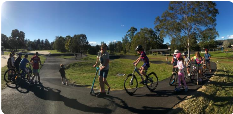
Council is proposing to build pump tracks, like the very popular Kyogle pump track above, at Bonalbo, Tabulam and Woodenbong.