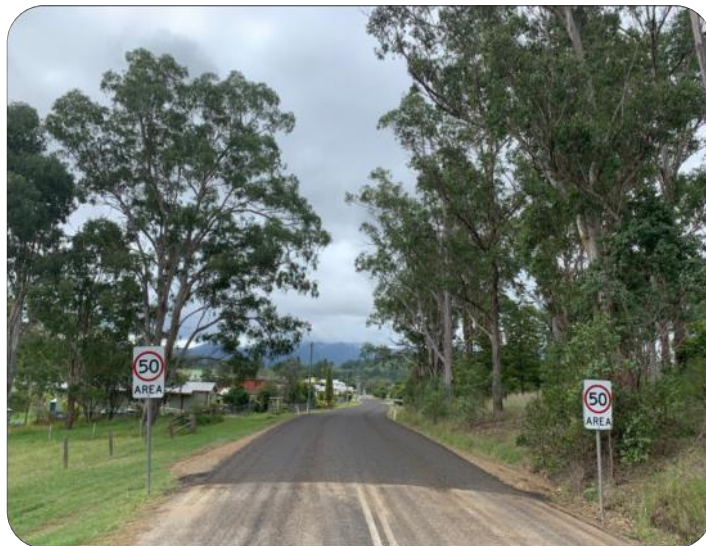
Above: New surfacing works in MacPherson Street, Woodenbong

mence in May and once complete, the crew will move on to rehabilitation of Capeen Street in Bonalbo followed by improvements to road surface at the bus pull-over at Mallanganee.