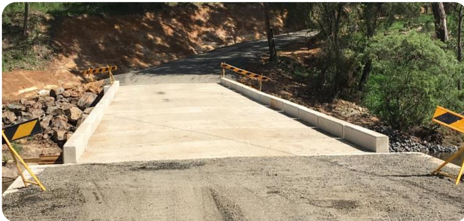
Work on the new Mulcahy Bridge on Needhams Road, including the approaches, is now complete and the bridge is open to traffic.

The work is to restore some stormwater infrastructure that suffered damage in the heavy rain in February and was further im-