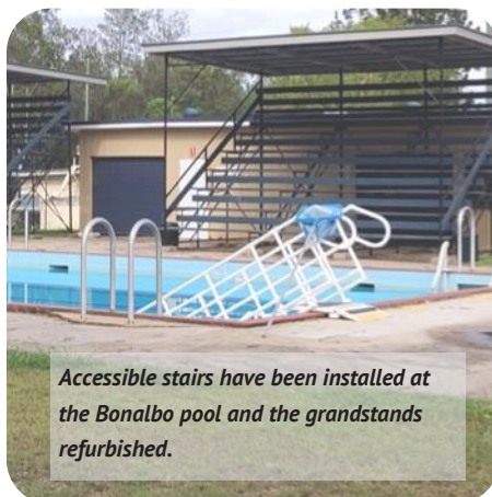
Accessible stairs have been installed at the Bonalbo pool and the grandstands refurbished.

The project cost $55,000 and involved the installation of six inverter reverse cycle air conditioners.