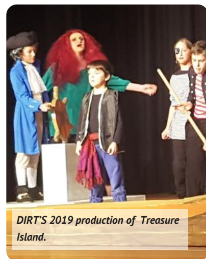
DIRT'S 2019 production of Treasure Island .

There are many backstage roles to be filled. All volunteers must undergo a NSW Working with Children check.