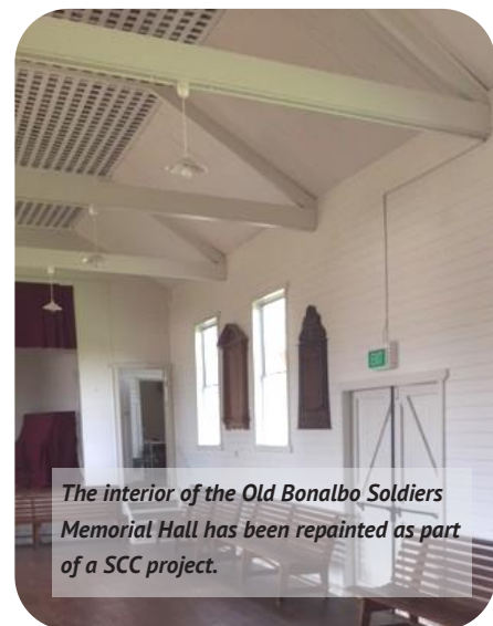
The interior of the Old Bonalbo Soldiers Memorial Hall has been repainted as part of a SCC project.