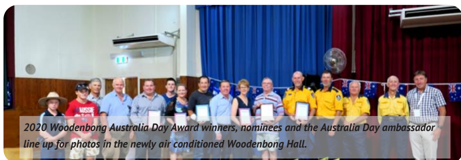
2020 Woodenbong Australia Day Award winners, nominees and the Australia Day ambassador line up for photos in the newly air conditioned Woodenbong Hall.