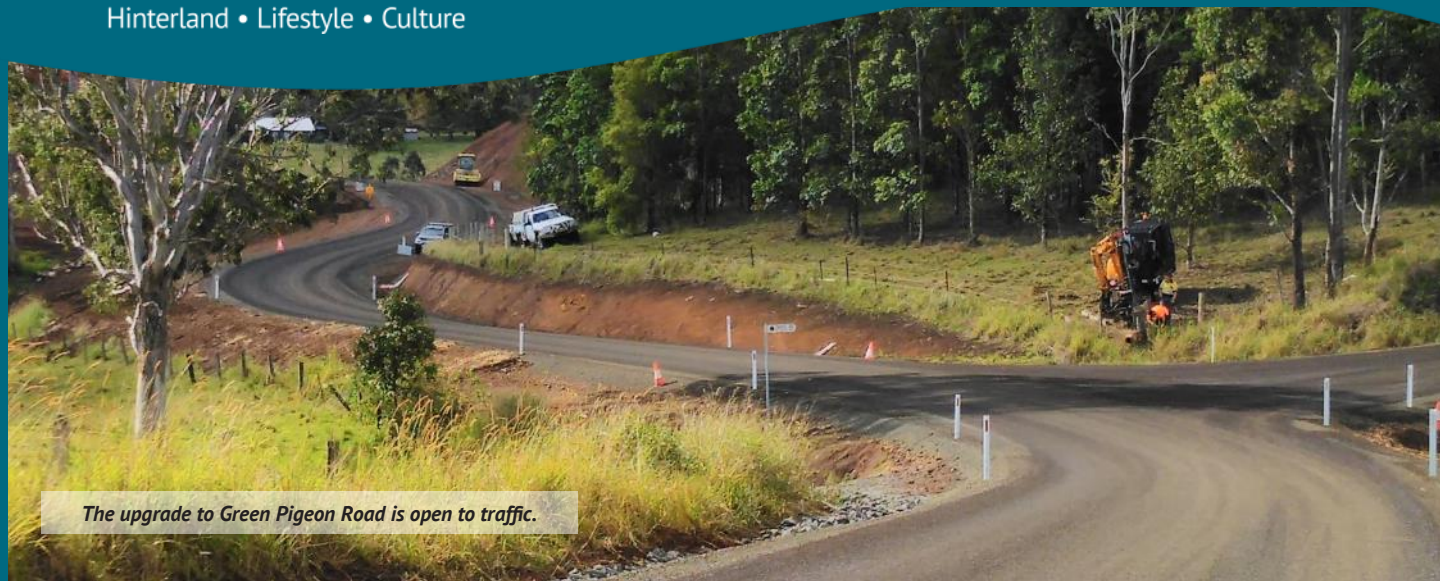
The upgrade to Green Pigeon Road is open to traffic.