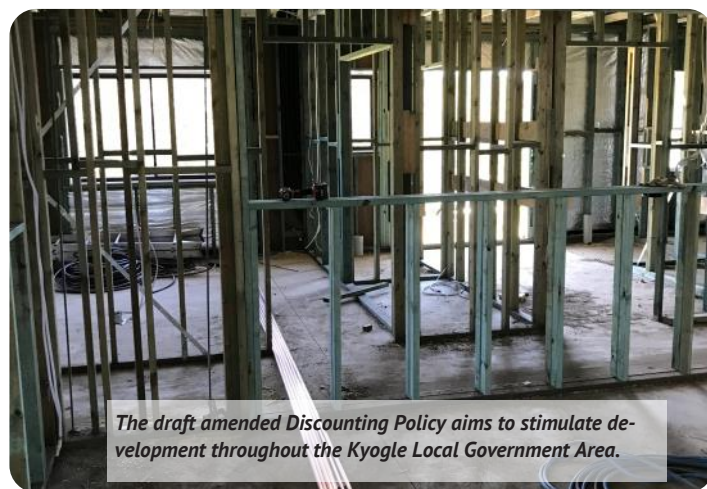
The draft amended Discounting Policy aims to stimulate development throughout the Kyogle Local Government Area.

"This policy is unique in the Northern Rivers and shows that we are prepared to be innovative to attract investment and stimulate economic growth," she said.