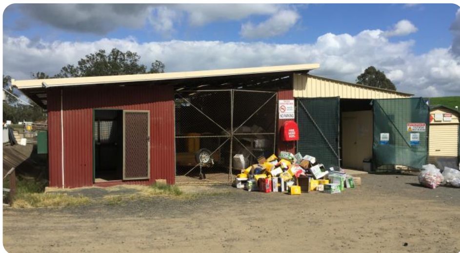
The newly rebuilt Tip Shop at the Kyogle Landfill.

"In addition to the environmental benefits of reducing the amount of waste going to landfill, Council is seeking to support the work of local community groups by providing an avenue, through the Tip Shop, for such groups to generate further income for delivery of community projects and services."