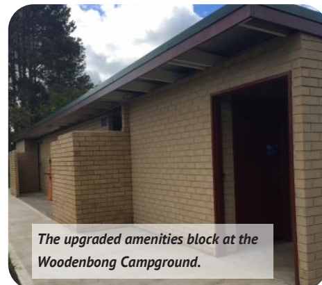
The upgraded amenities block at the Woodenbong Campground.

The project has given the Woodenbong community an improved community facility to complement those currently available and provide a place for the whole community to enjoy.