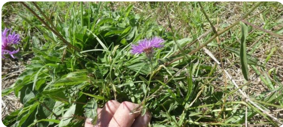
Above: Black knapweed seedlings found on the roadside near Tenterfield. Below: Mature Black knapweed plants found at the same location.

Listed as prohibited matter in the Biosecurity Act 2015 , it is regarded as a significant biosecurity risk in NSW.