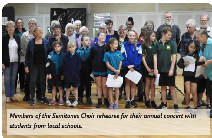
Members of the Semitones Choir rehearse for their annual concert with students from local schools.