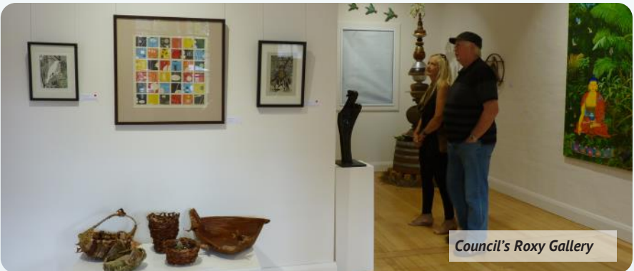
Council's Roxy Gallery

We all committed to the ones we have identified during our many workshops, but if we are expected to deliver on the government's priorities too, the JOs need