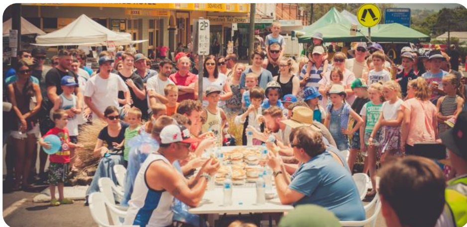
Spectators watch the pie eating competition at the 2016 Fairymount Festival.