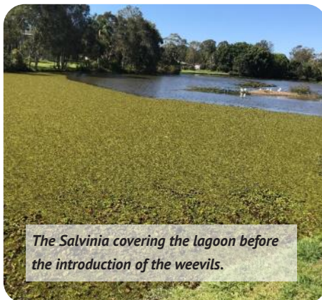
The Salvinia covering the lagoon before the introduction of the weevils.

Initially, the Salvinia overgrowth was so thick at Waterlily Park that biological control would not have worked. For insects to succeed, at least a third of the water body needs to be cleared.