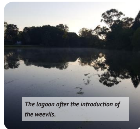
The lagoon after the introduction of the weevils.

So an integrated control plan was carried out using the biological control agent