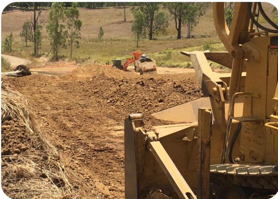
Bulk earthworks on the Green Pigeon Road realignment project.

It is now expected to be finished in late