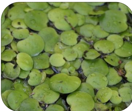
Frogbit, pictured above, is one of the highest priority action weeds in NSW

"We are putting our best efforts to stop