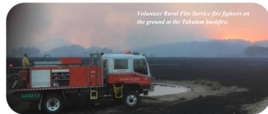
Volunteer Rural Fire Service fire fighters on the ground at the Tabulam bushfire.

Meanwhile, disaster assistance has been made available to people affected by the fires in both Kyogle and Tenterfield Shire local government areas.