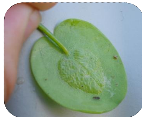
A distinguishing feature of Frogbit is the airsac on the underside of the leaf.

the spread of this Frogbit in this area and highlight the importance of these actions to the community."