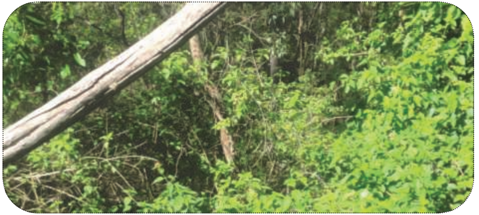
Lantana, if left unchecked, can take over the forest understorey and lead to Bell Minor Associated Die Back

"The NSW Government is currently assessing the management of public forests and assumes that nothing can be done for dieback-affected forests other than to cut them down.