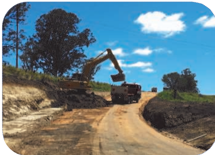
Work is progressing on the Culmaran Creek Road upgrade.

You may see these works being carried out on Imesons Road, Eden Creek Road, Duck