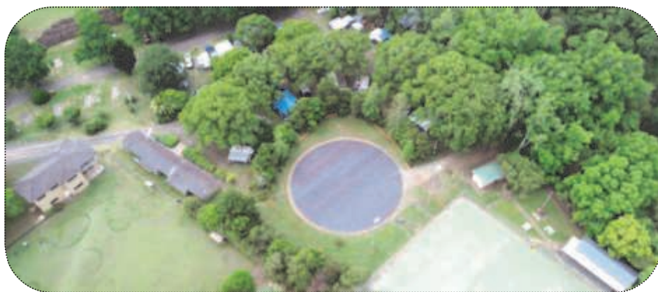
An aerial view of the labyrinth under construction at the Kyogle Recreation Reserve.

Kyogle Amphitheatre Stage is currently in construction and aimed for completion in time for Carols-by-Candlelight this Christmas. The stage has been designed in consultation with members of the commu-