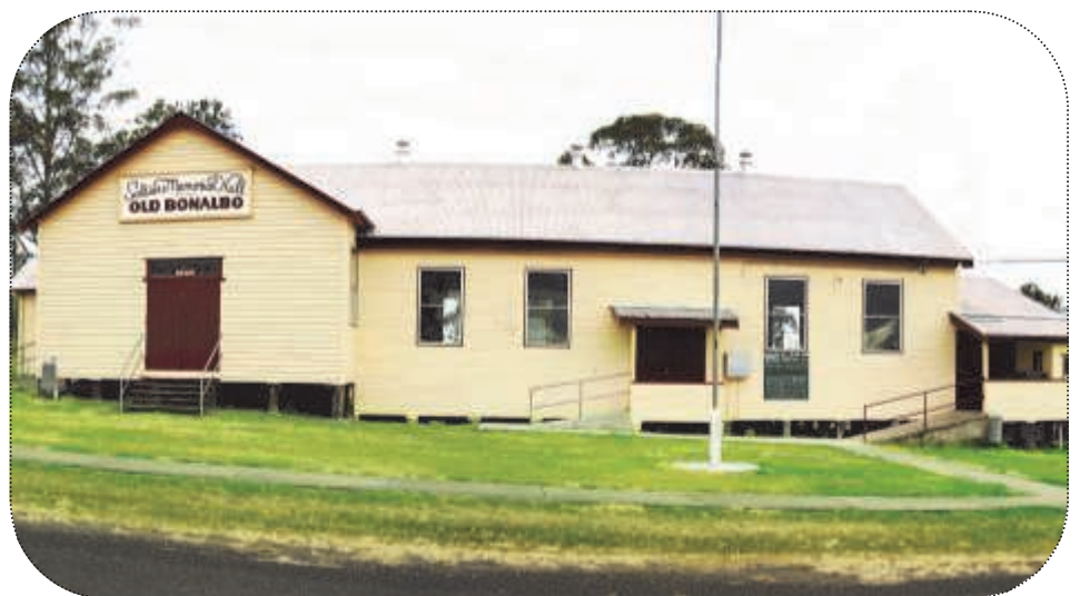
A $50,000 grant from the Stronger Country Communities Fund will be used to paint the interior of the Old Bonalbo Hall, upgrade the hall's septic system and sand and seal the hall's timber floors.

Kyogle Rifle Range Improvements, $75,000 - Improvements will include shade structures, amenities, and increased accessibility.