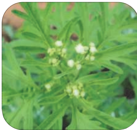
ABOVE: Parthenium weed. RIGHT: Tropical Soda Apple.

This weed is endemic to central Queensland and is spreading into the south of the state. Germination can occur at almost any