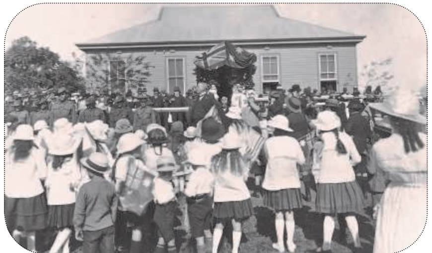
NSW Governor Sir Walter Davidson addresses children outside the Kyogle Shire chambers on 14 June 1918 during the very first Vice Regal visit to Kyogle. The current Governor of NSW, the Honourable David Hurley, will visit Kyogle to open an exhibition at the KMI celebrating Centenary of the World War I Armistice.

The exhibition will feature World War One memorabilia and the records of more than 800 Kyogle District soldiers who served in the war, many of whom lost their lives.