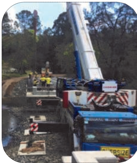
Crews work on the Campbells No 2 Bridge replacement, which is now complete and open to traffic with restrictions.

Recent inspection of stormwater pipes in the Geneva area has revealed the need for follow up works to address infiltration of the storm water system by tree roots.