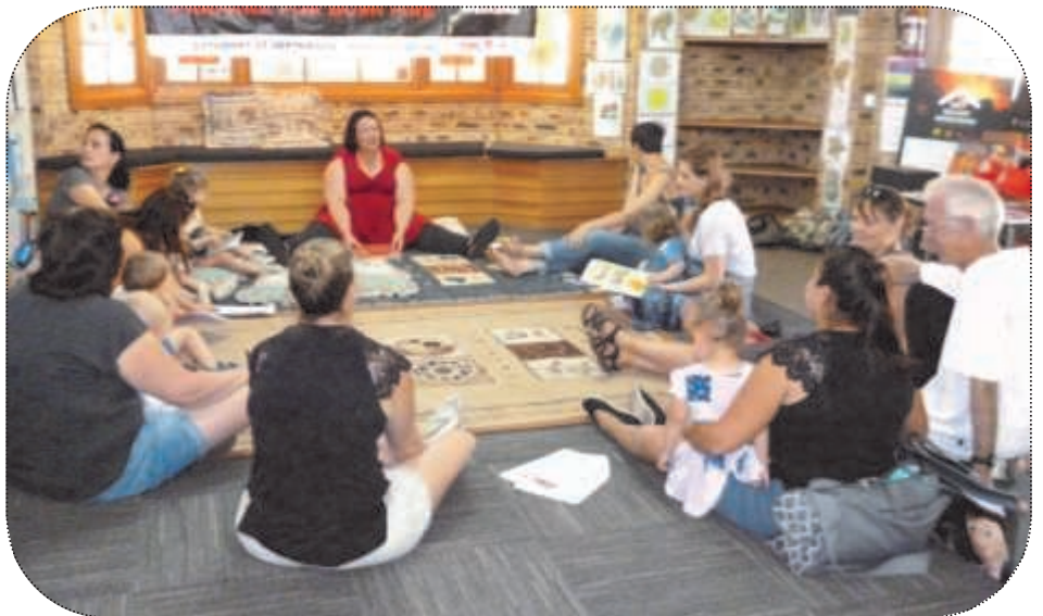
Youngsters and their parents/caregivers enjoy a Start Together Story Time session at Kyogle library. Start Together Story Time is held at the library every Friday from 10-11am. It gives parents and carers a chance to share stories, rhymes and songs with their young ones (babies through to three-year-olds) in the company of others.