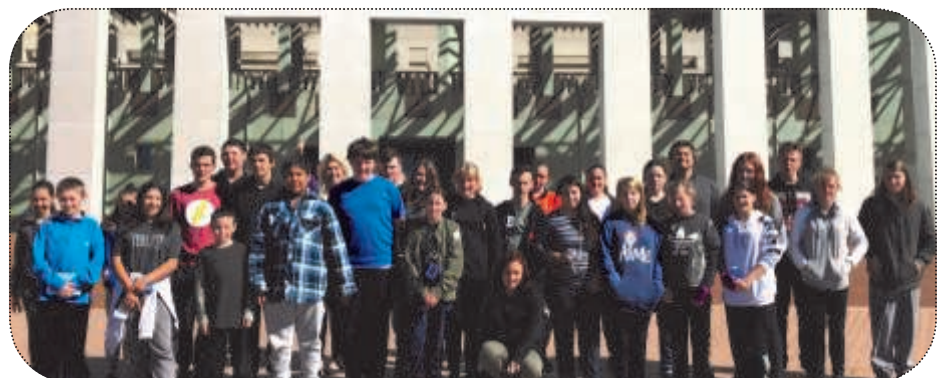
Bonalbo Central School students pose for a photo outside Parliament House, Canberra.

They also visited the Australian War Memorial and were lucky enough to witness the Last Post ceremony.