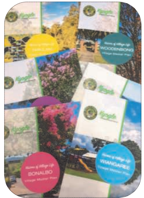
The Visions of Village Life masterplans pictured above can be downloaded from Council's website or viewed at village post offices or stores.

There are also copies available for viewing at the following locations; Mallanganee Store and Post Office, Tabulam