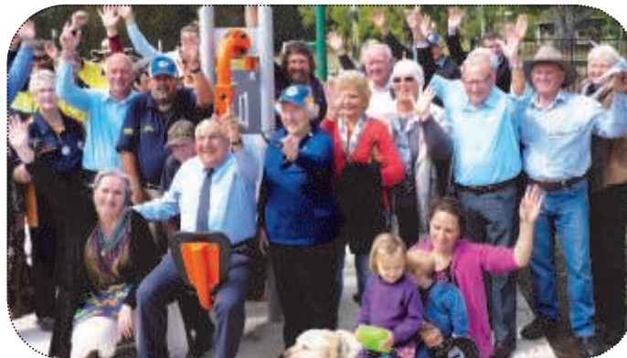
The community celebrates the official opening of the new outdoor gyms.

would provide free recreational opportunities for all community members and was the result of strong community collaboration.