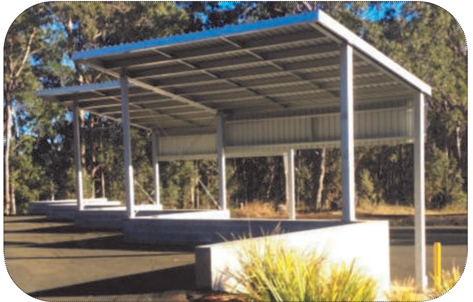
Construction of the new Woodenbong waste transfer station was supported by the Environmental Trust as part of the NSW EPA's Waste Less, Recycle More initiative, funded from the waste levy.

Works associated with landfill closure and transfer station construction were carried out by local contractors.