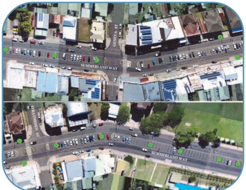
A bird's eye view of the locations of the street trees that will be planted in the Kyogle CBD over the next two months as part of the long running Main Street Upgrade Program.

The work will be carried out by Council staff and local contractors and will result in temporary lane closures in the main