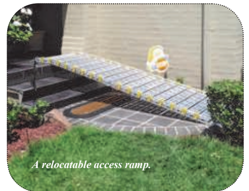
A relocatable access ramp.

To find out more, please phone Council's Planning and Environmental Services