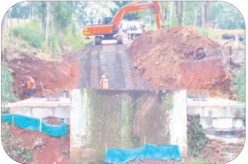
Council's bridge crew at work on the abutment under slab on the new bridge on Afterlee Road.

Council is managing this project on behalf of Roads and Maritime Services and the extensive program of works includes stabilisation, landslip repair, subsoil drainage works, installation of kerb and guttering, culvert replacement and pavement works and will be completed in three stages.