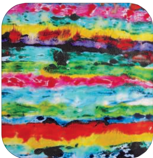
Above: Merle Rankin's painting Haiku 1 .