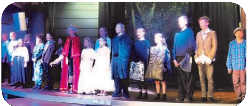
Drama in Rural Towns students on stage for their recent production of Fables and Folktales.

For information on the classes, email villagehallplayers@gmail.com .