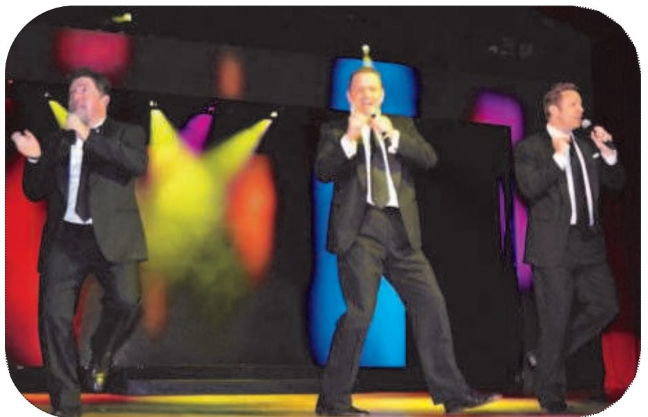
Tenori will return to perform in Kyogle in August.

They bring their sense of fun and sophistication to classics from the worlds of opera, musical theatre, jazz and everything in between.