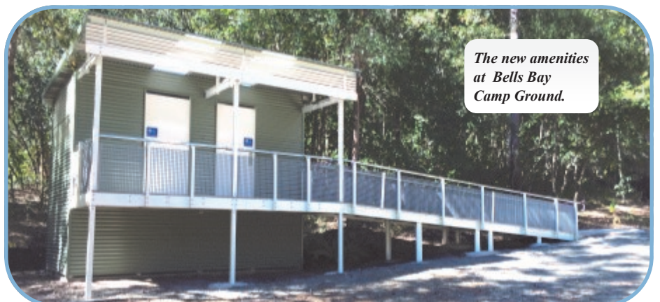
The new amenities at Bells Bay Camp Ground.