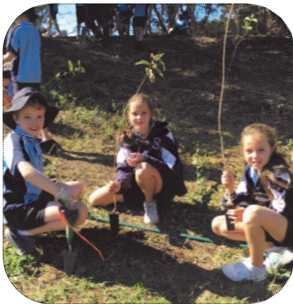
St Brigid Primary School students prepare trees for planting as part of Planet Ark's Schools Tree Planting Day.

Please contact Council's Assets and Infrastructure Services Department on 6632 0221 for further information.