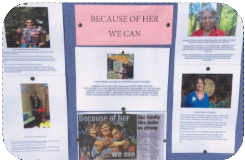
One of the displays at Bonalbo Central School's NAIDOC celebrations honouring local indigenous women.

Organisers of the NAIDOC celebrations have thanked sponsors: Bonalbo Central School Parents and Citizens' Association, Kyogle Council, Mountain Blue Farms, Aboriginal Affairs NSW, Rekindling the Spirit, Hart Services and Farmer Charlies.