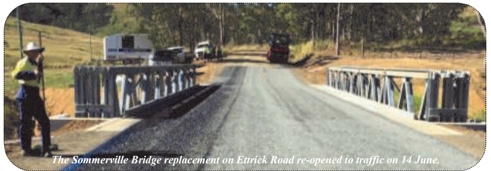
The Sommerville Bridge replacement on Ettrick Road re-opened to traffic on 14 June.

Council's contractor Ozwide Constructions has started the replacement of Ro-