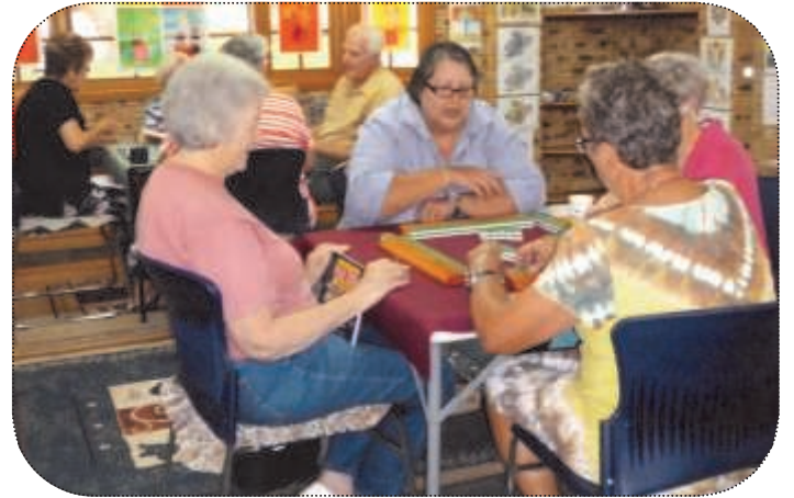
The Kyogle Mah Jong group meets at the Kyogle library every Tuesday from 1-3.30pm. Beginners and new members are welcome.

Currently, adult colour-in sessions are held on the second Friday and fourth Wednesday