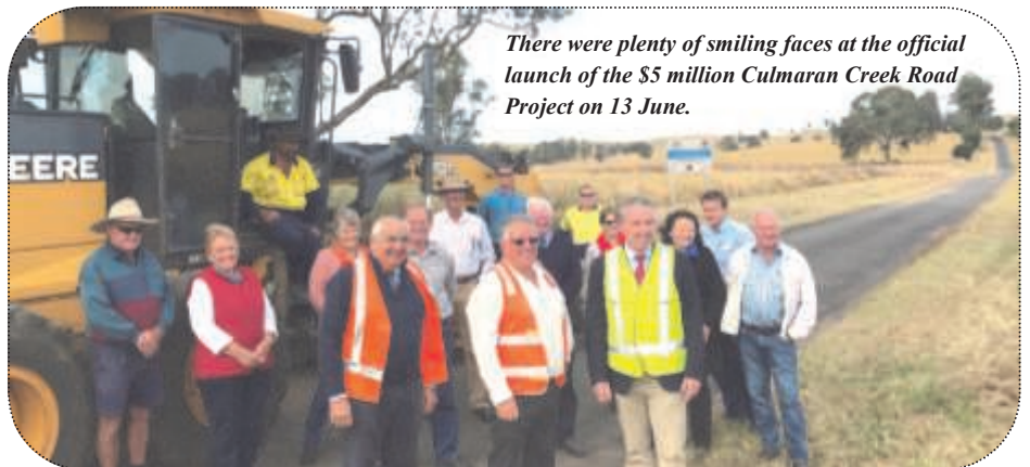
There were plenty of smiling faces at the official launch of the $5 million Culmaran Creek Road Project on 13 June.

• Improvements to the gravel sections of Culmaran Creek Road to be used for de-tour during the works, including replacement of a small single lane timber bridge with a concrete pipe culvert