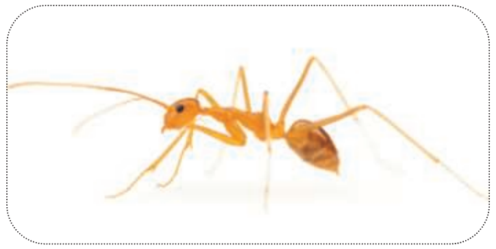
Yellow Crazy Ants (Anoplolepis gracilipes) have been found at Lismore.

If you see these ants – yellow or brownish, about 5mm long, with very long legs and antennae and an erratic walking style – you can report them on the Biosecurity Hotline on 1800 680 244, the NSW Department of Primary Industries website at www.dpi.nsw.gov.au/biosecurity/forms/report-exotic-ants , or