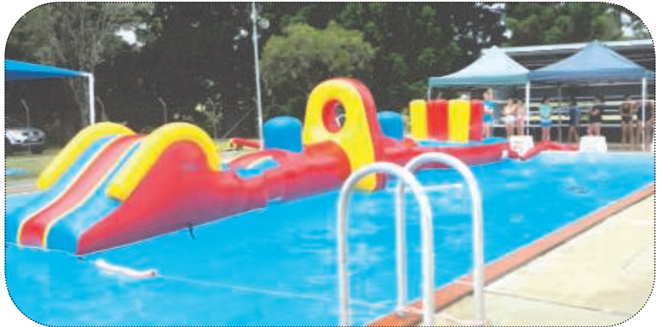
The inflatable activity centre has been a huge hit at Council's three public pools this season.

Submissions should be made in writing by 4pm on 14 May 2017 to the General Manager, 1 Stratheden Street, Kyogle or to council@kyogle.nsw.gov.au .