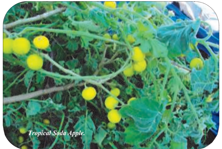
Tropical Soda Apple.

If you have never had TSA on your property and suspect you may have it, please contact Rous County Council on 6623 3833.