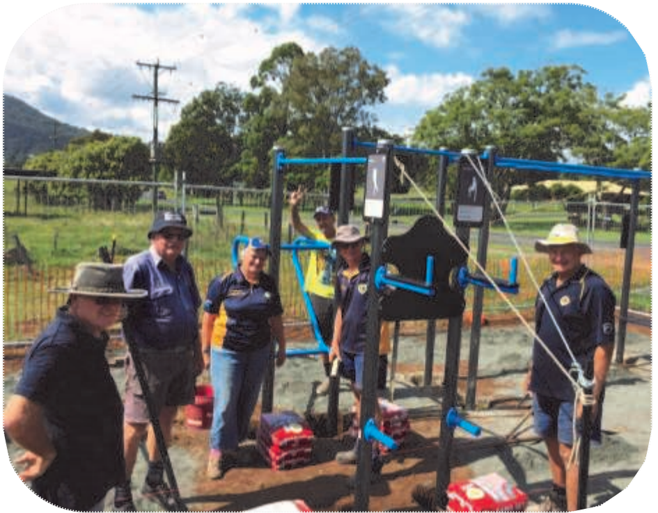
Kyogle service club members work on the new outdoor gym being installed at Geneva.

The four new outdoor gyms are expected to be completed by July.