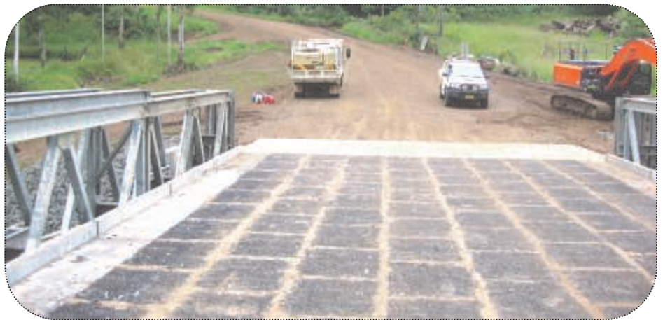
Council crews put the finishing touches to the last of the six bridges replaced as part of the Gradys Creek Lions Road bridge renewal program,

Grading also will be conducted in the Dyraaba area during May. Road pavement repairs for the month will be focussed on Tabulam Road and Theresa Creek Road.