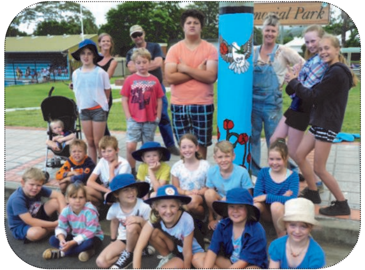
Students, teachers and parents of Afterlee Public School pose for a photo in front of one of the four power poles they have painted as part of an ongoing town beautification/art project.

Stage one of the project last year generated plenty of positive feedback and is credited with attracting tourists to the