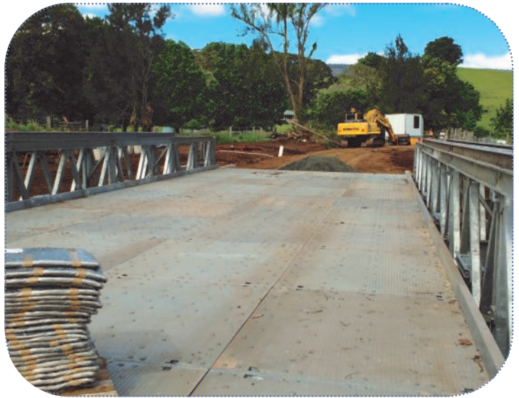
The newly installed Boorabee Park Bridge on Back Creek Road.

Sealed road patch repairs will be carried out on Deep Creek Road, Homeleigh Road, Green Pigeon Road and on Clarence Way from Old Bonalbo north to Woodenbong.