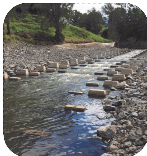
The multi-award winning Kyogle fishway.

Kyogle Council partnered with DPI Fisheries, NSW Public Works, Restart NSW, the NSW Environmental Trust and the NSW Recreational Fishing Trust to deliver this project.