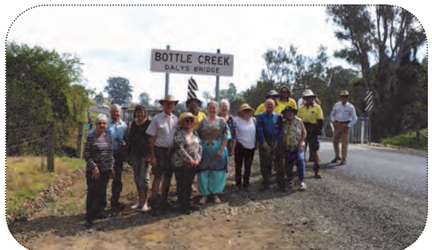
Right: Residents and staff celebrate the opening of Dalys Bridge on Tabulam Road

"Council is very appreciative of the funding provided through this program and for the support provided by the Member for Page, the Hon. Kevin Hogan MP".