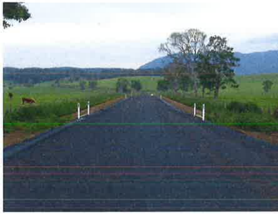
Completed Bitumen Sealing at Section 1