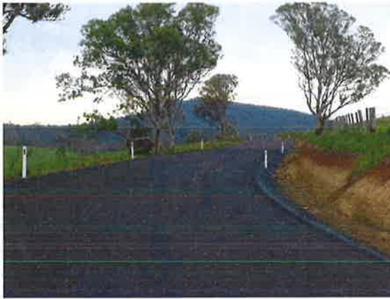
Completed Bitumen Sealing at Section 4