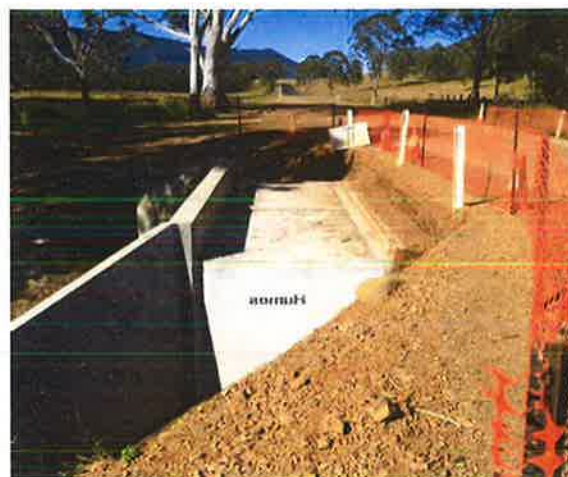
Box Culvert Extension at the Golden Mile (Section 3)