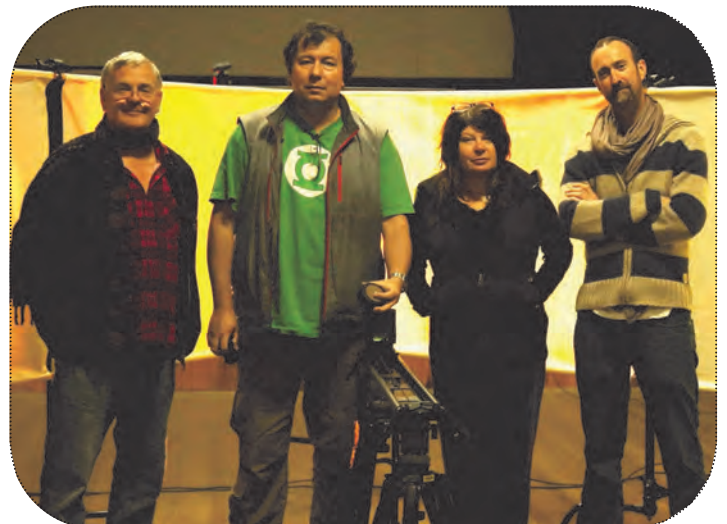
The Bonnywood Rising production crew.

The full program of events can be found at www.ifthesehallscouldtalk.com.au/program