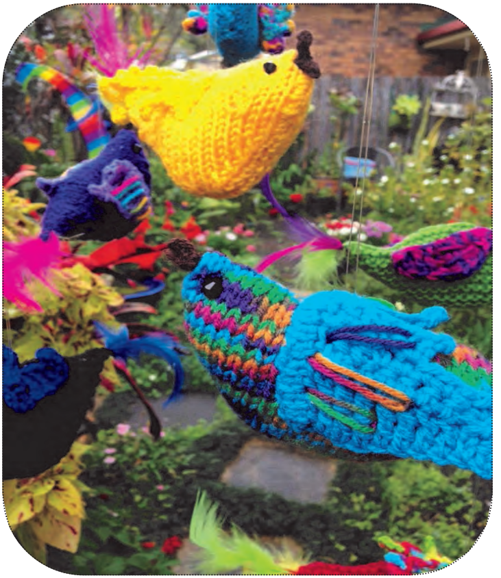
LEFT: A basket by Cherie Shadwell on show at the Fibre Frolics exhibition. ABOVE: Fibre creation Birds in the Garden by Lynda Clark.