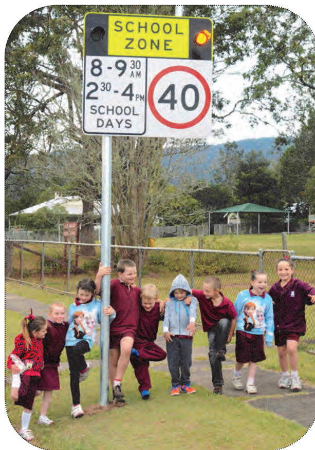
Old Bonalbo Primary School students celebrate the installation of flashing warning lights outside their school.

So when trucks and workmen arrived at the school about a month ago to install the flashing warning lights on school approaches, there were celebrations all round.