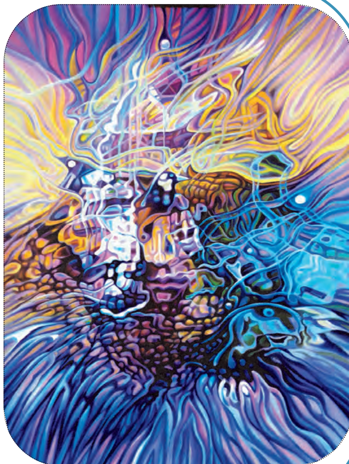
Above: one of Gery Mews colourful works of art.

The exhibition will run until the 31 October.