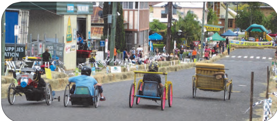
Below: Participants in the Billycart Bonanza race for the finish line. Ideal weather conditions made for an enjoyable fun-filled