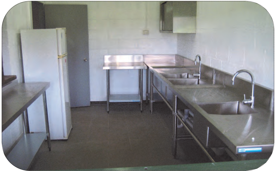
Above: The renovated kitchen in the Don Gulley Oval clubhouse. Below: Filling in open drains around the clubhouse has provided a viewing area over the oval.

viewing platform to the edge of the oval.