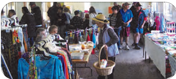
Left: End of an era. - The Yowie Country Markets in Woodenbong were held for the last time recently.