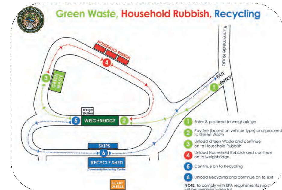
Above: A consultant's view of how the new museum is expected to look.

Customers dropping off rubbish only or recycling only will have to complete a 'loop' of the site, while customers with mixed loads (rubbish and recycling) will have to complete a 'figure 8' of the site. Customers in small vehicles will still pay