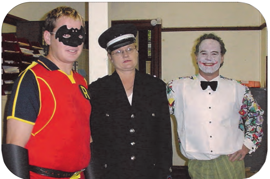
Kyogle Council staff take part in the Fairymount Festival's Crazy Day dress-up competition in 2002..

"The festival was a lot of fun and brought the community together. It also shone a spotlight on the town and helped