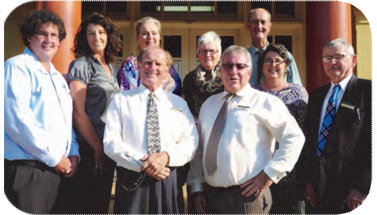
The newly elected Kyogle Council.

"Opportunities that will arise out of growth, opportunities from the Beaudesert-Bromelton State Development Area, opportunities surrounding diversification and