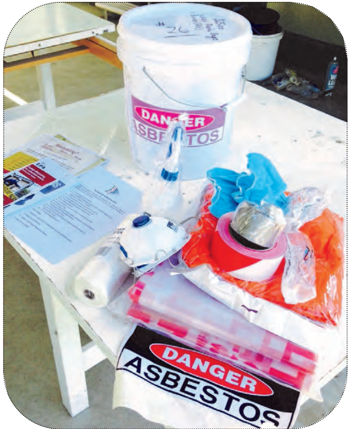
Above: Asbestos disposal kits contain everything householders need to safely dispose of up to 10 square metres of asbestos.

The kits are fully funded by Kyogle Council. To avoid disappointment, please contact Council on 6632 1611 to confirm that there are still kits