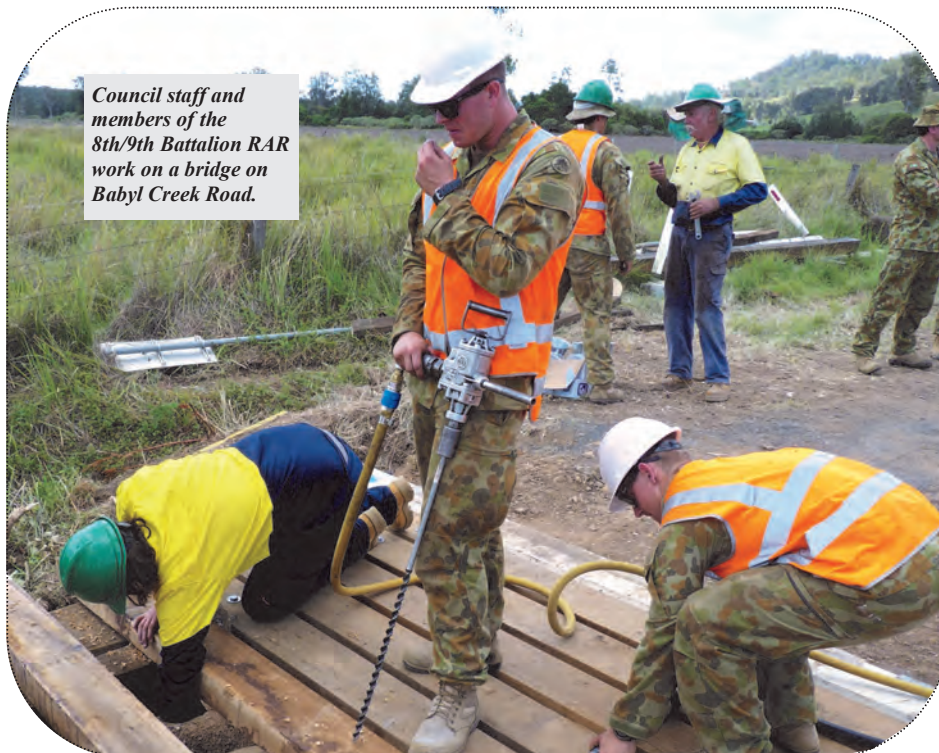
Council staff and members of the 8th/9th Battalion RAR work on a bridge on Babyl Creek Road.

Council started work on replacing the water main in Bloore Street, Kyogle in October and is hoped to be finished in December. The Bloore Street main was laid in the 1950s and in recent years leaks and burst pipes have been common. Council thanks everyone affected by these works for their patience.