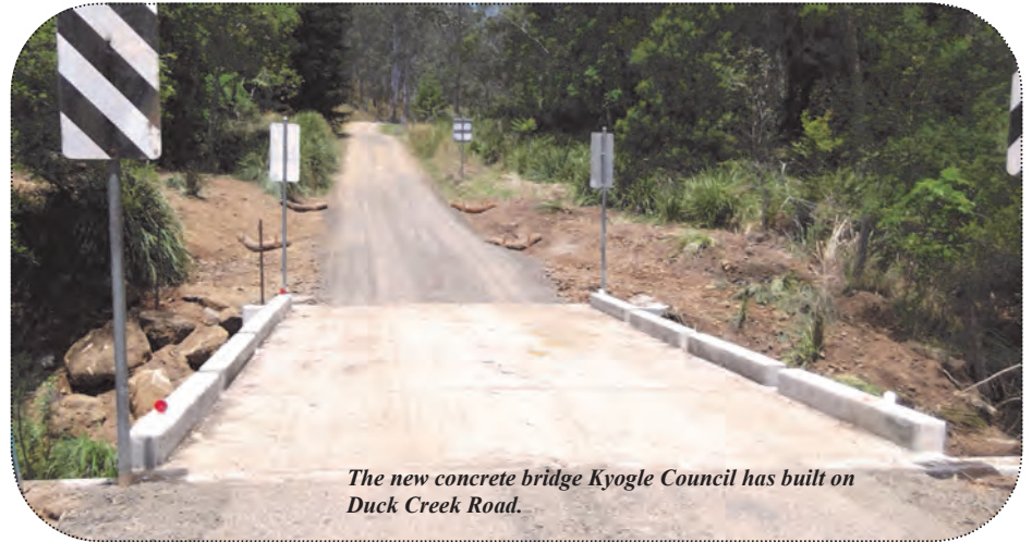
The new concrete bridge Kyogle Council has built on Duck Creek Road.

The replacement of a culvert on the Bruxner Highway near Mallanganee also is planned, with contractors undertaking