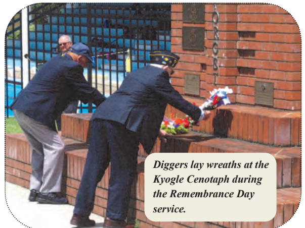
Diggers lay wreaths at the Kyogle Cenotaph during the Remembrance Day service.