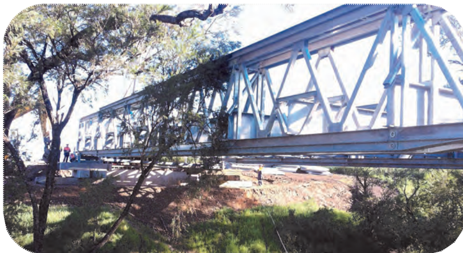
The new modular steel bridge which was erected over Doubtful Creek at Sextonville during construction. It replaced an old timber bridge.

The other two bridges on Yabbra Road and Sextonville Road were replaced with new concrete and steel bridges.