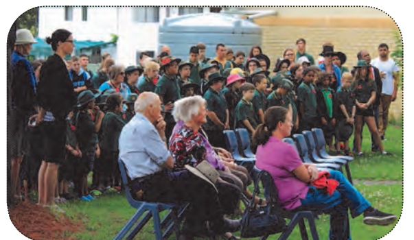
The Woodenbong Remembrance Day service.