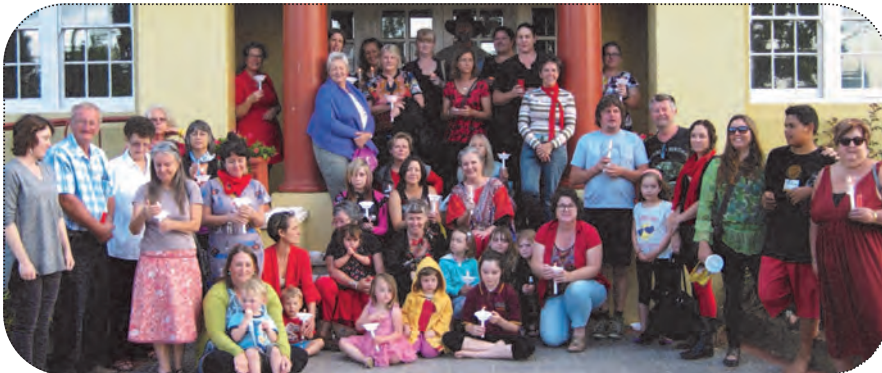
Kyogle district residents took part in the national Women Light The Way candlelight vigil to remember the 72 Australians who have lost their lives to domestic violence so far this year.