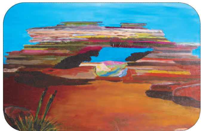
Harvey Reddell's untitled art work is part of the Different Strokes exhibition at the Roxy Gallery, Kyogle.