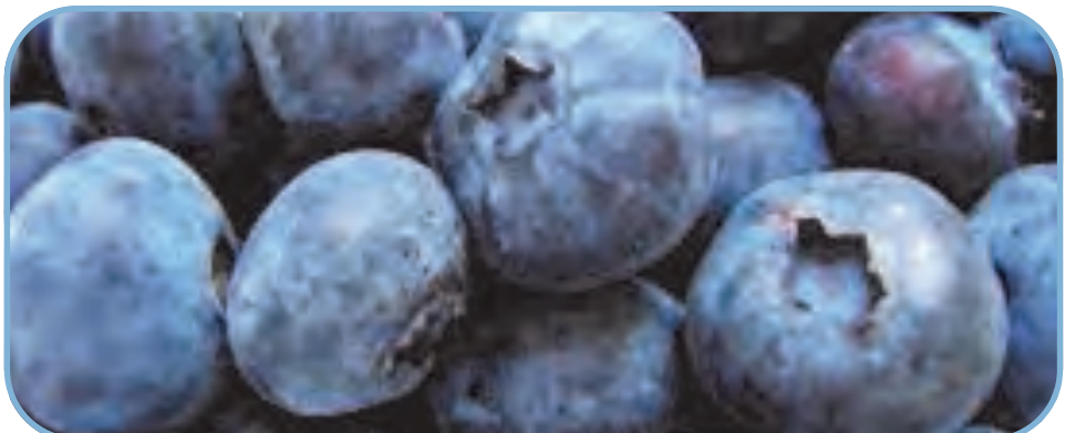
A $3 million blueberry packing plant approved for development at Tabulam is expected to create 22 permanent jobs.

"The Council has worked closely with Mountain Blue Farms to ensure that any