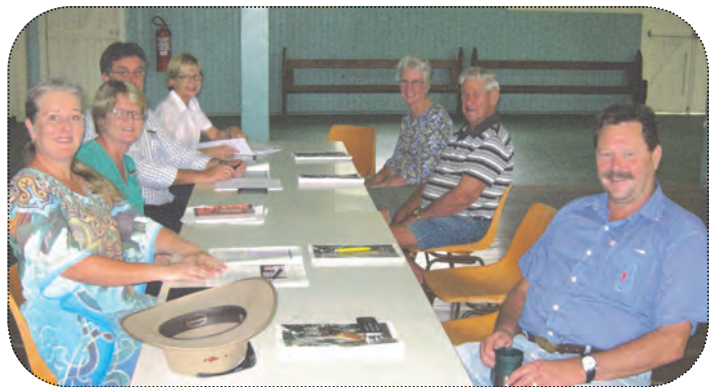
Community members, Kyogle Councillors and staff at the draft CSP roadshow meeting held at the Wangaree on Monday 29 February.

The draft CSP can be downloaded from Council's website at www.kyogle.nsw.gov.au or hard copies are available for viewing at Kyogle Council, the Cawongla store, the Wadeville store, Wangaree Post Office, Woodenbong Post Office, Bonalbo Post Office, Old Bonalbo Post Office, Tabulam Post Office, and the Murrumbidgee Post Office.