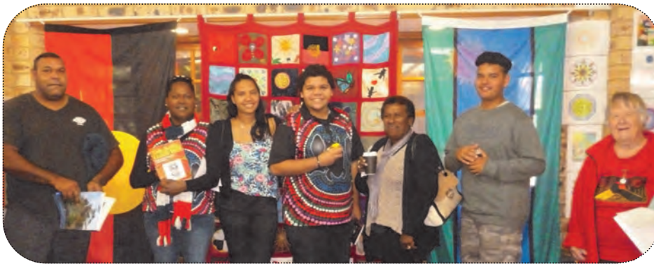
LEFT: Community members check out Kyogle library's indigenous materials exhibition held to celebrate National Reconciliation Week.