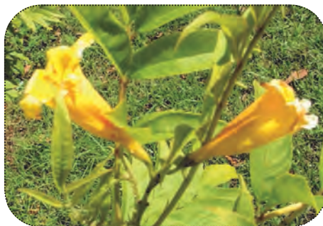
The flower of the yellow bells or yellow trumpet bush.

Yellow bells has readily been found as a self-seeded plant in people's gardens or on roadsides. It invades disturbed, rocky,