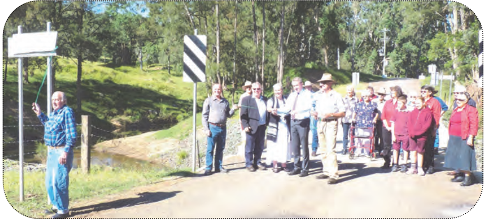
Member for Page Kevin Hogan cuts the ribbon to open McKees Bridge while a member of the McKee family unveils the sign for the new bridge.

“Council hopes to have the other six bridges on Gradys Creek and Lions roads finished later this year and has applied for further funds under the program.”