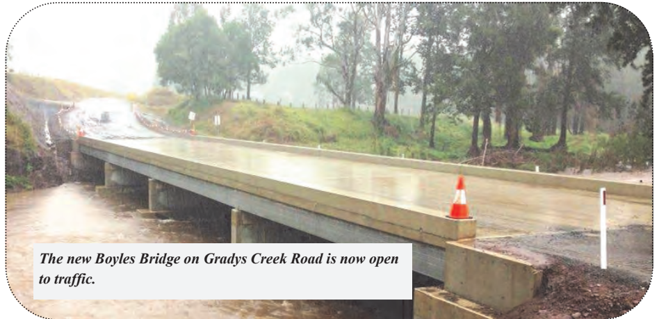
The new Boyles Bridge on Gradys Creek Road is now open to traffic.

This project involved sealing of more than 7km of gravel road, line marking and drainage improvements.