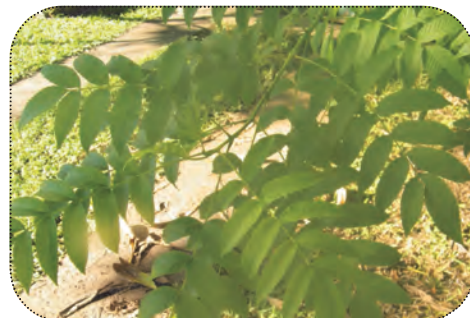
The leaves of the yellow trumpet bush.

sandy and cleared areas of land. It also quickly establishes itself on creek banks and riparian areas where it forms dense monocultures.