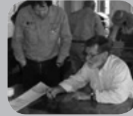
RFS HOT SPOTS