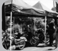
LIONS TT WRAP UP