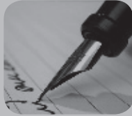
FROM THE MAYOR