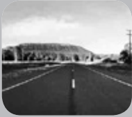
LTFF AT A GLANCE