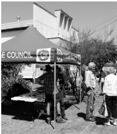
Kyogle Council's Listening Post stall at the Woodenbong Yowie Country Market

That feedback will be collated and used to compile a report which will go before Council at its ordinary meeting on Monday, 8 December, 2014.