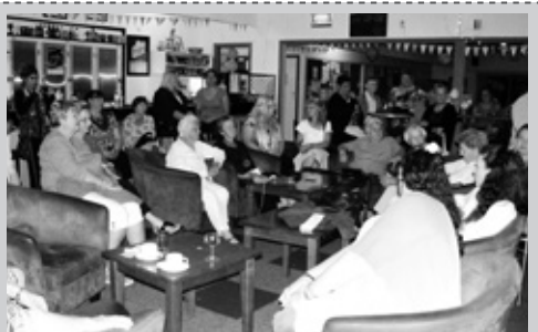
Having fun at the Woodenbong Girls Night In are some of the 61 women who attended the fundraising event for the Cancer Council.

At the close of counting, the total amount raised was an impressive $1632.95.