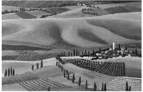
Tuscany Landscape Italy by Deborah Brown

Insect pollinators and their importance to the production of food under pins much