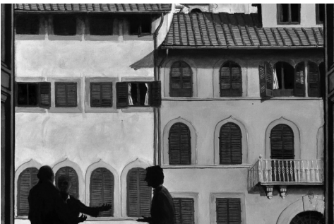
Conversation Florence Italy