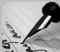
FROM THE MAYOR