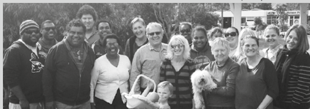
Former leaders of the Kyogle Reconciliation Group hand over the reins to the group's new committee members.