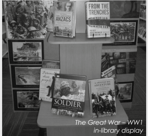
The Great War – WW1 in-library display

Kyogle library is commemorating the End of the Great War – WW1 – with an in-library display from our extensive WW1 collection. Why not peruse the display and learn about Archie Barwick's remarkable story