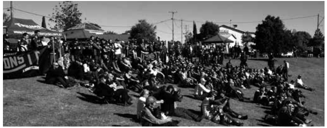
Members of the Lions TT Founders group at the Kyogle Amphitheatre following their founders ride on Sunday July 6, 2014.

Café Racer Sprint and novelty events the following road closures are