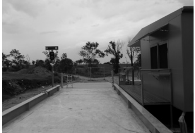
Partially completed weighbridge at Kyogle Landfill

Construction of a new 50 tonne electronic weighbridge at the Kyogle Landfill is nearing completion. Contractors Aussie Weighbridge Systems have been fortunate with a run of good weather with the slab, weighbridge deck and concrete approaches now completed and the installation of the gatehouse and office almost complete. Council will be undertaking improvements on Runnymede Road and the entrance into the landfill. These works, weather permitting, are scheduled this month (December) and the internal roads will be completed early in the new year with the weighbridge likely to be in operation from mid February 2015. The weighbridge will ensure the accurate recording of all waste and