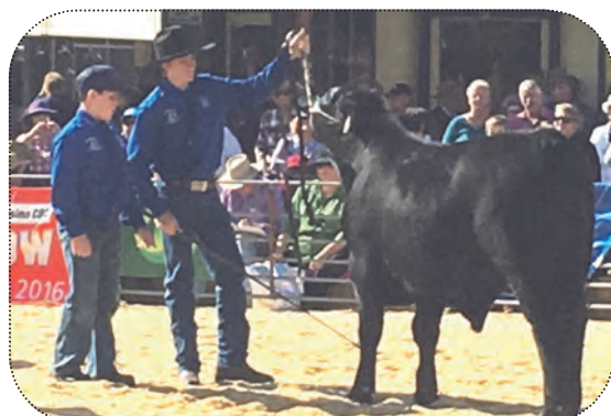
Left: Members of Bonalbo Central School's agriculture team take part in the led steer competition at Casino Beef Week.