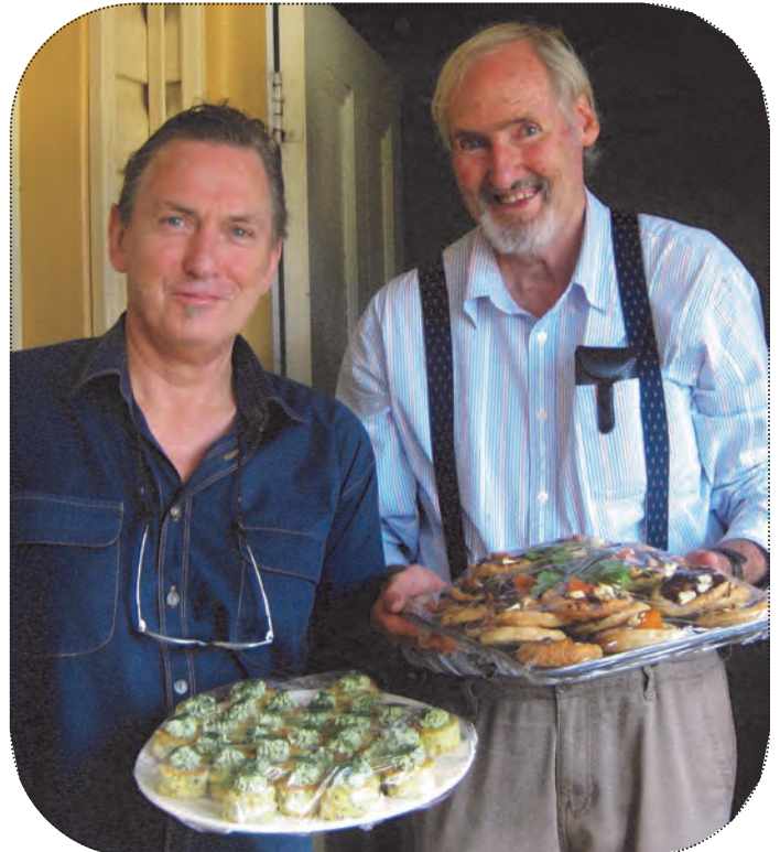
Kyogle Community Kitchen volunteers at the opening of the new facility, which will serve free lunches three days a week.