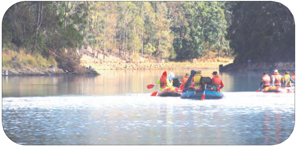
Kyogle Council believes that upgrading the Toonumbar Dam access road will dramatically increase tourism to the dam and surrounding national parks.

"The Toonumbar Water Retreat offers accommodation and conference facilities, a nine-hole golf course, a cricket oval, tennis courts, and fishing and boating