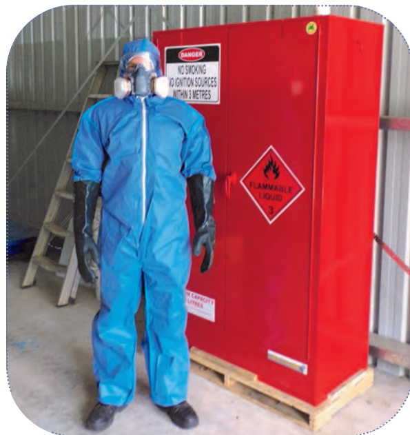
A Kyogle Council staff member suits up to contain a chemical spill which occurred at the Community Recycling Centre at the Kyogle landfill.

For further information please contact Council's Planning and Environment Department on 6632 0293.