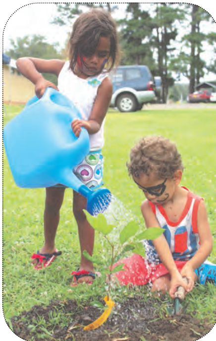
Above: Woodenbong pre-school children took part in an tree planting ceremony after the official opening of the town's skate park and outdoor gym.