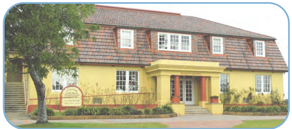
Kyogle Council Chambers

"Council can get back to the business of